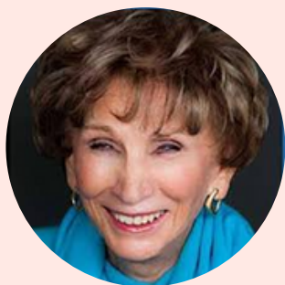
Dr. Edith Eva Eger

SELF CARE REWARD - Dr. Edith Eger loved to dance. Dance is a powerful way to release endorphins and help you to feel good. Turn on some tunes and dance dance dance!!